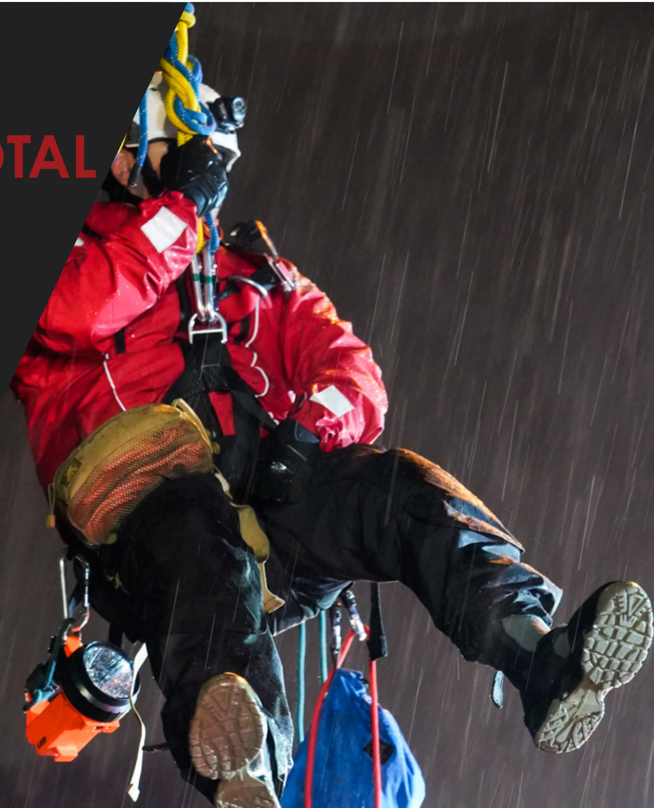
December 2021 - Swift Water Rescue.