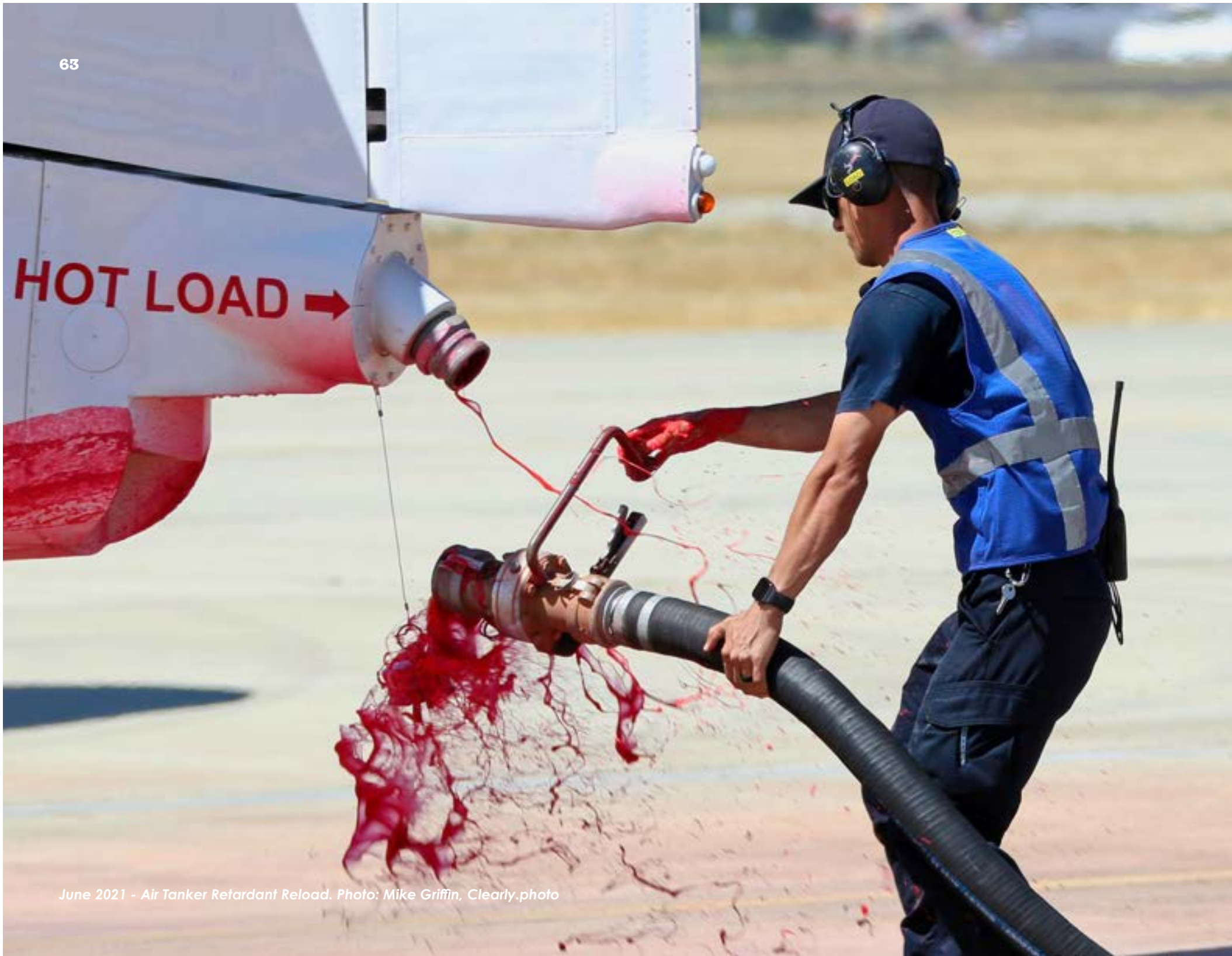
June 2021 - Air Tanker Retardant Reload.