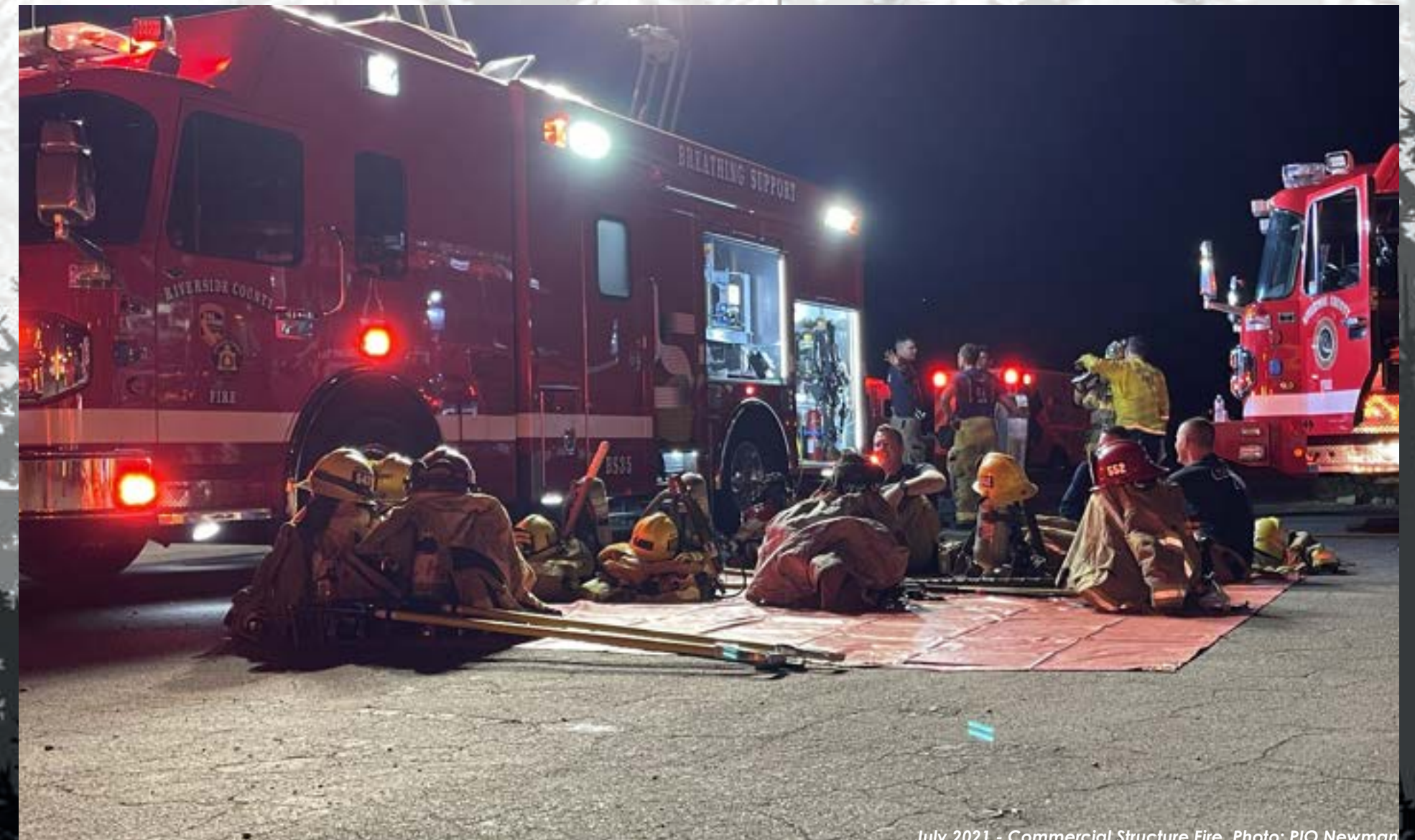
July 2021 - Commercial Structure Fire.