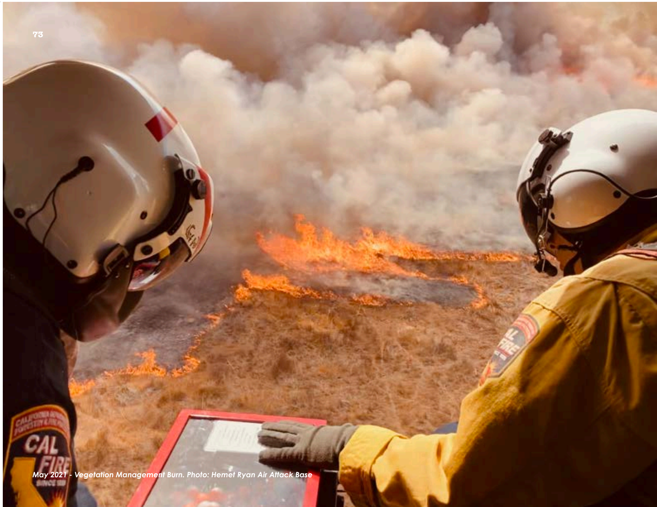
May 2021 - Vegetation Management Burn.