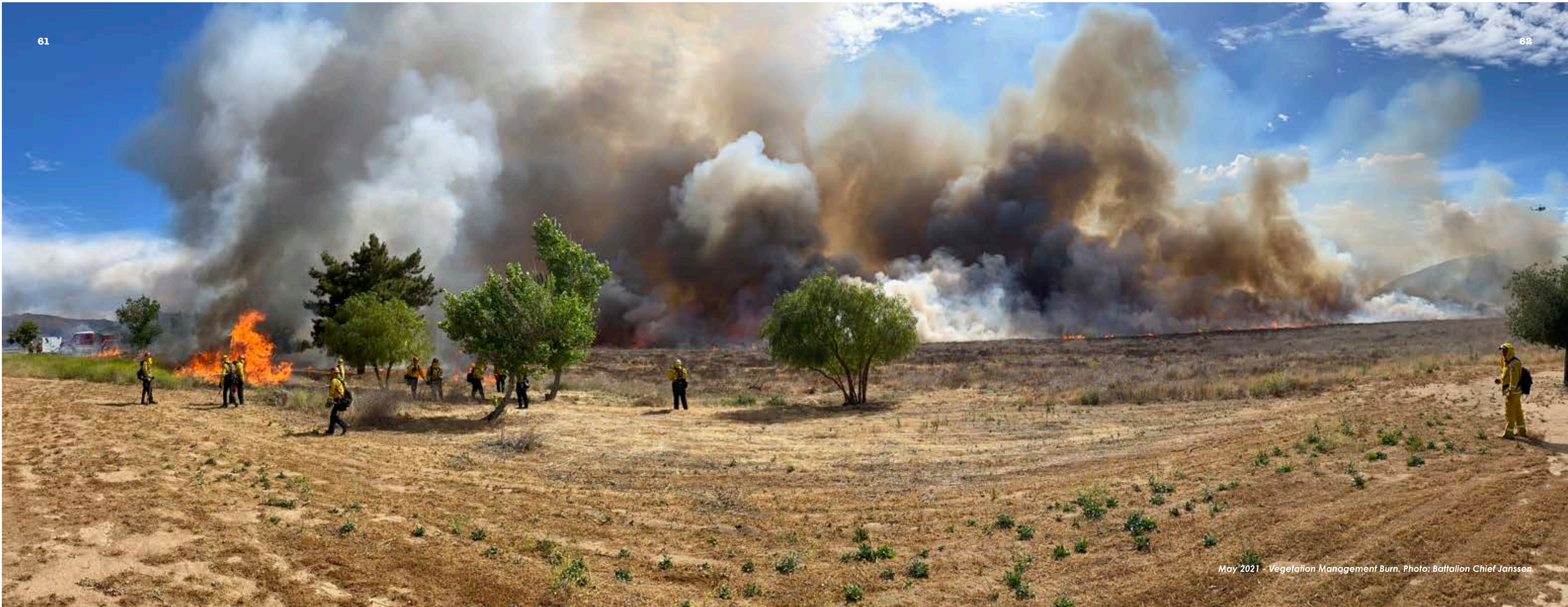
May 2021 - Vegetation Management Burn.