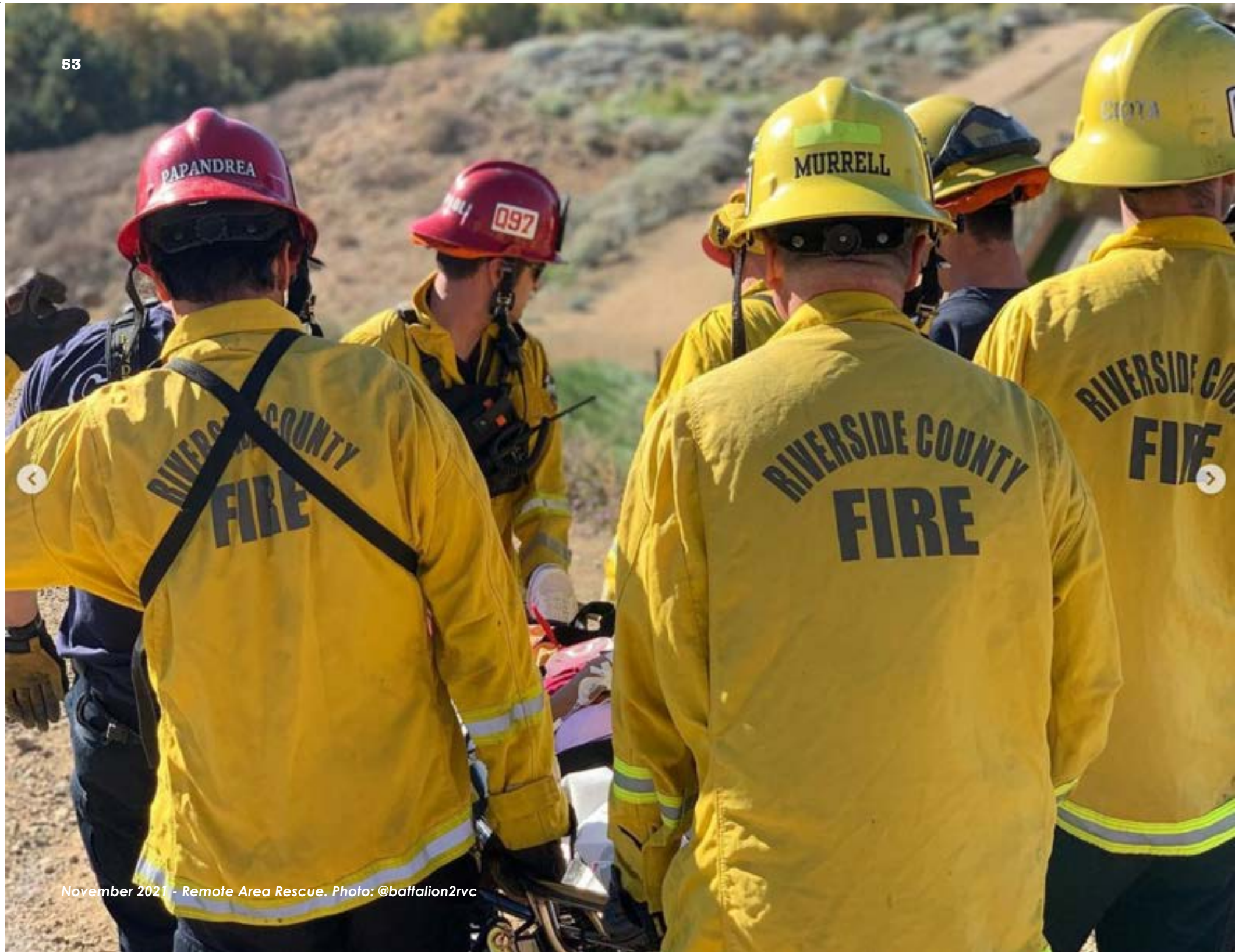
November 2021 - Remote Area Rescue.