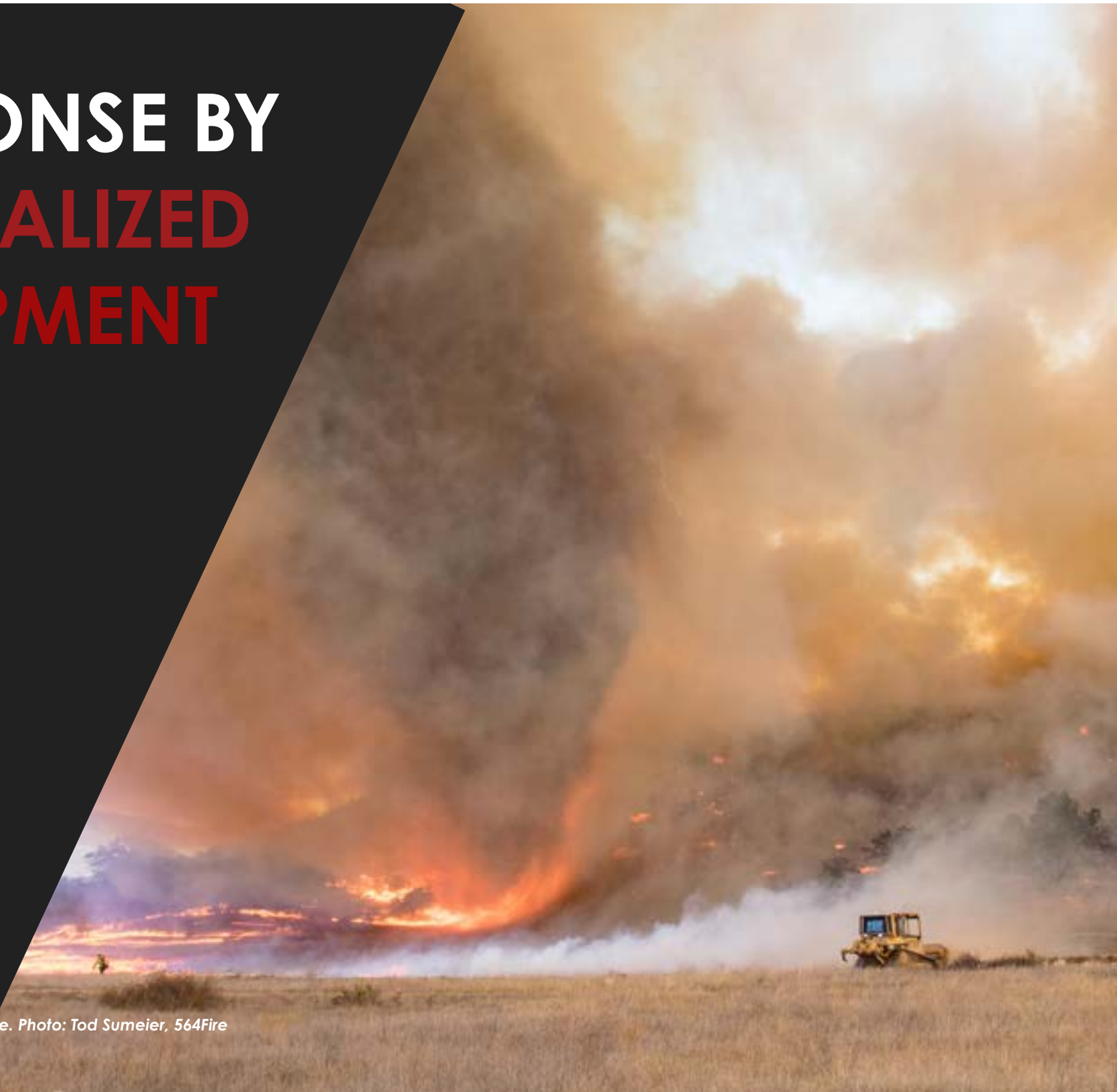
August 2021 - Vegetation Fire.