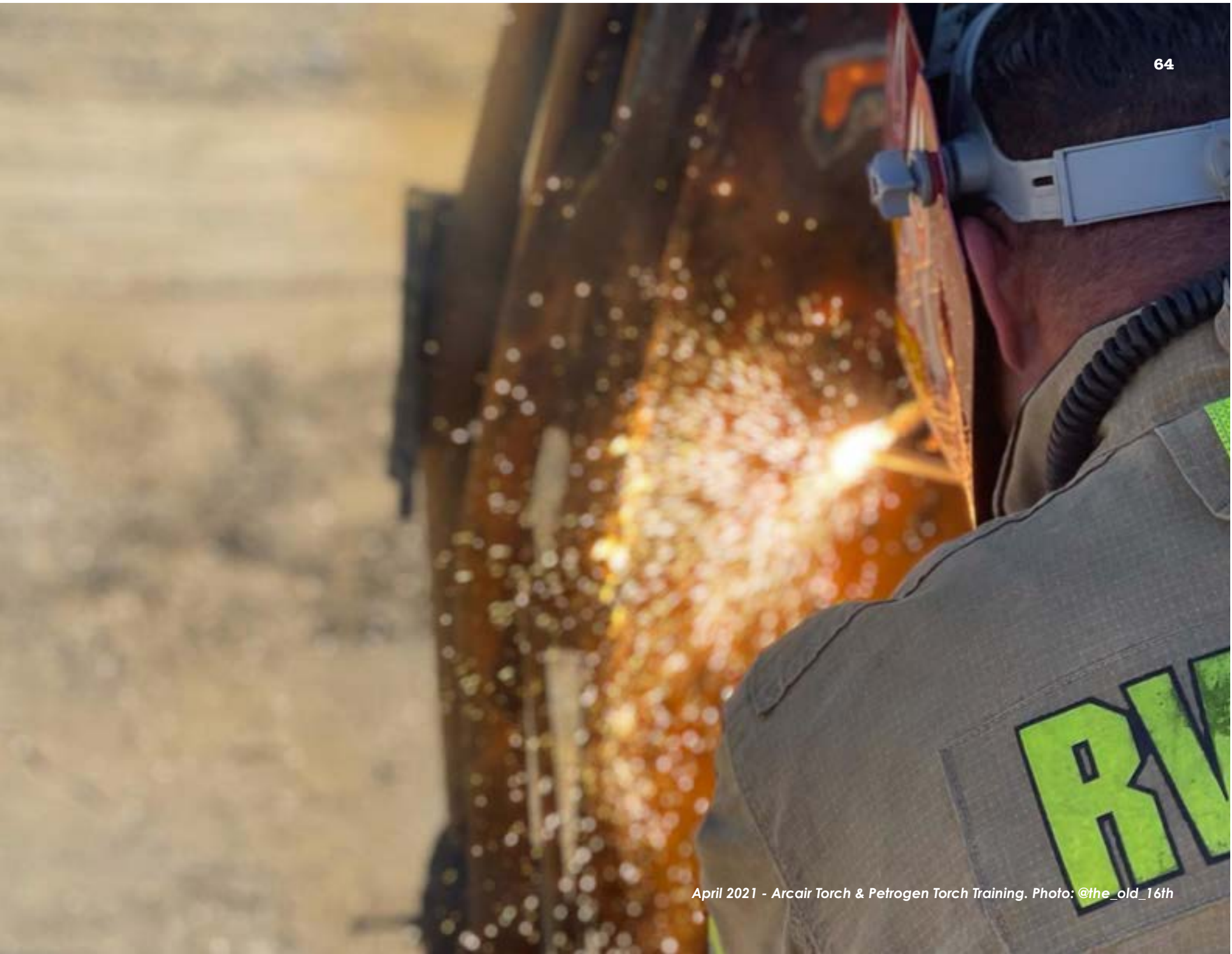
April 2021 - Arcair Torch & Petrogen Torch Training.