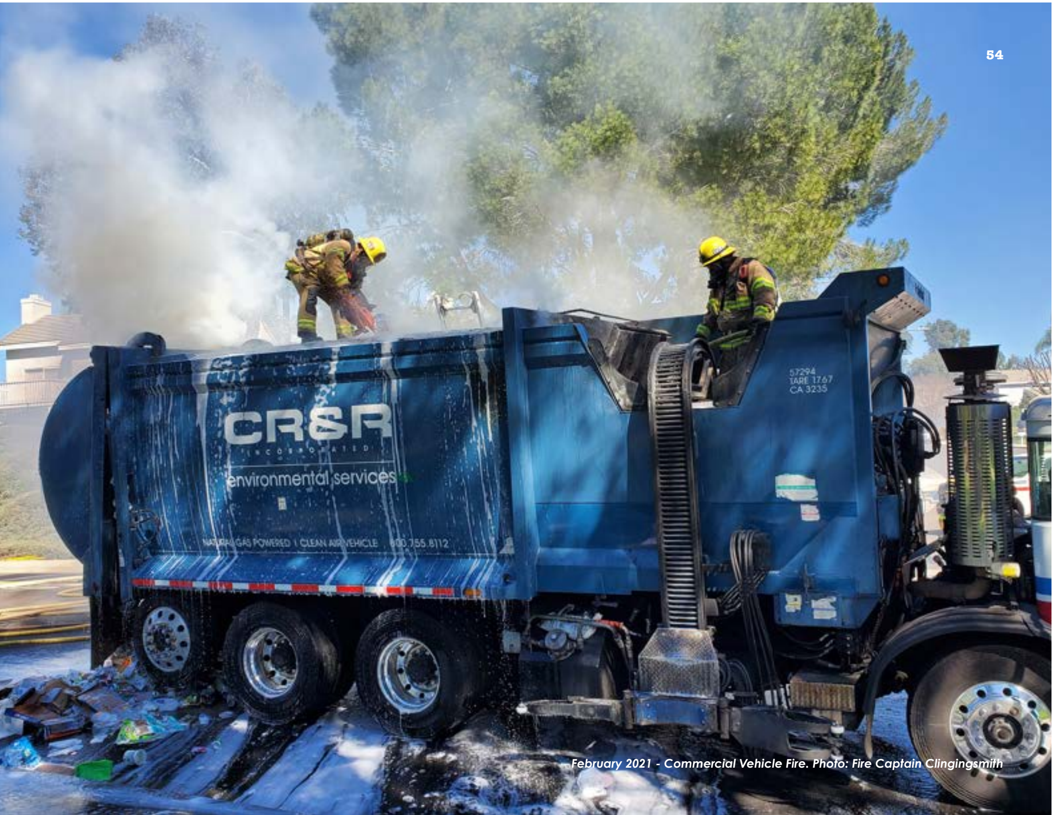
February 2021 - Commercial Vehicle Fire.