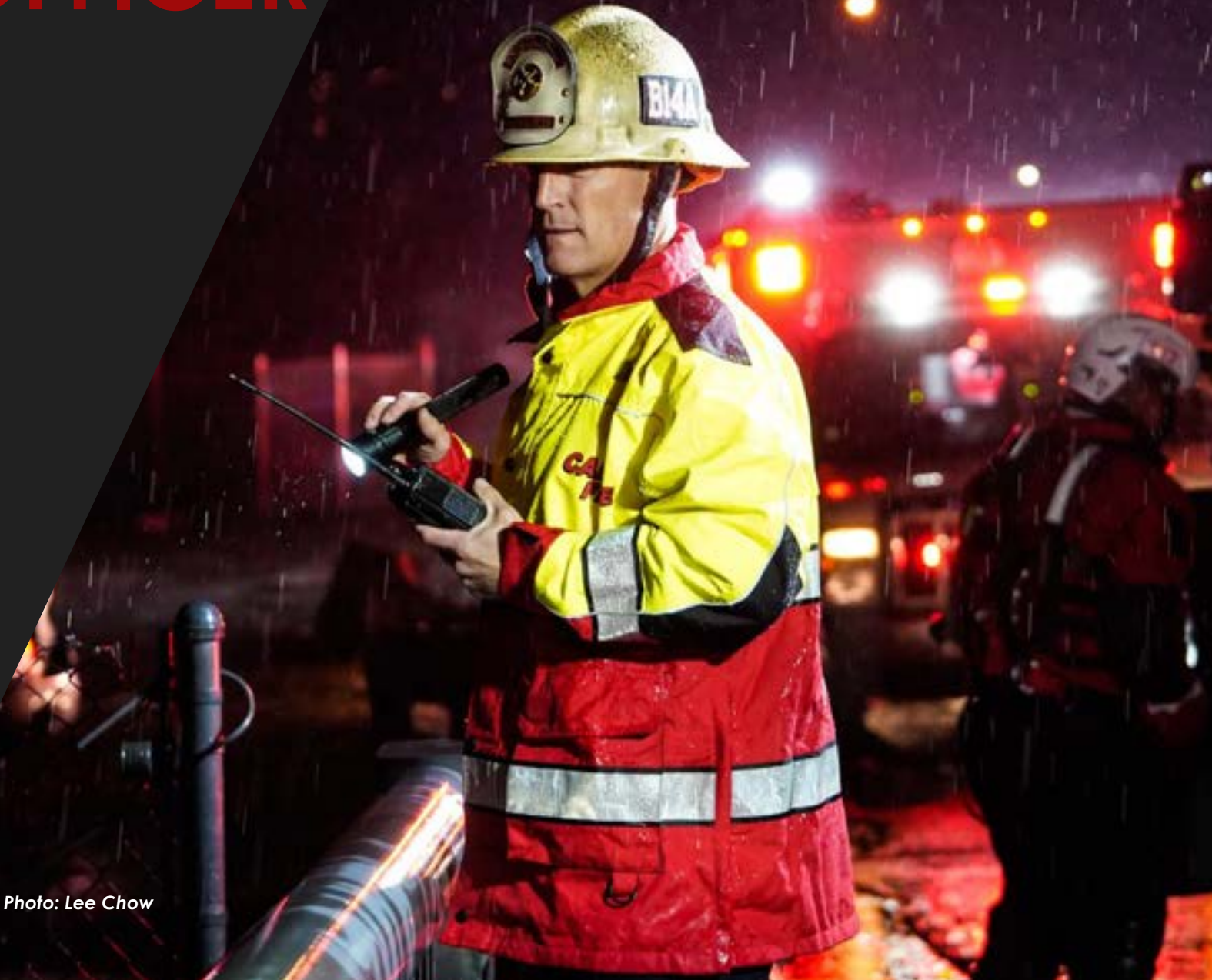
December 2021 - Swift Water Rescue.