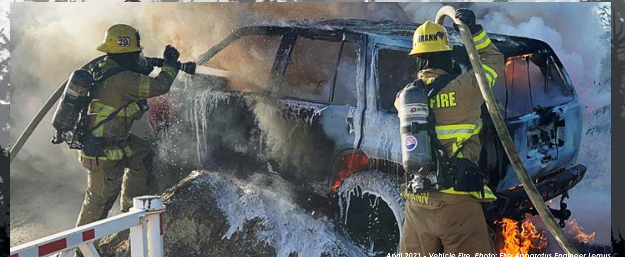
April 2021 - Vehicle Fire.