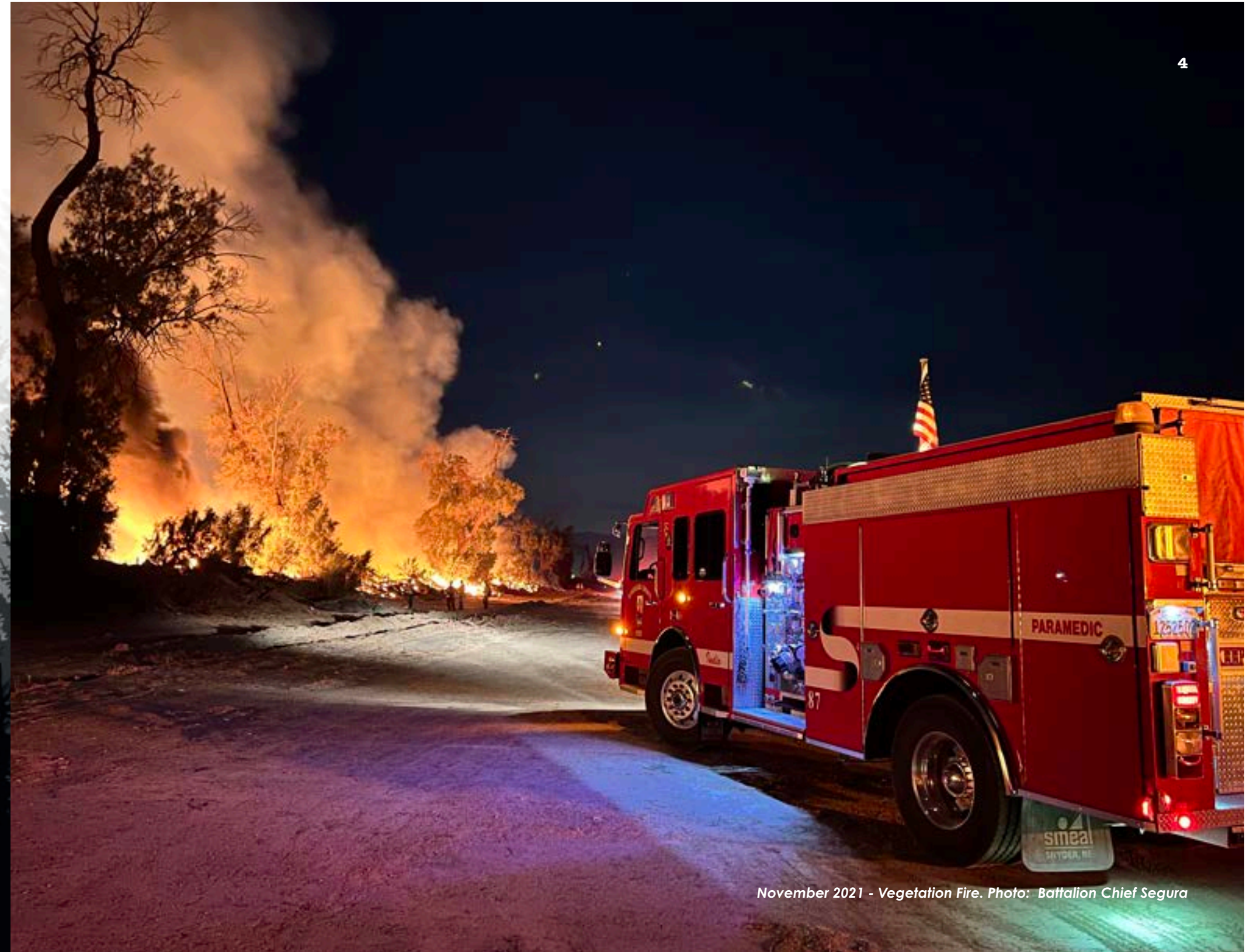
November 2021 - Vegetation Fire.