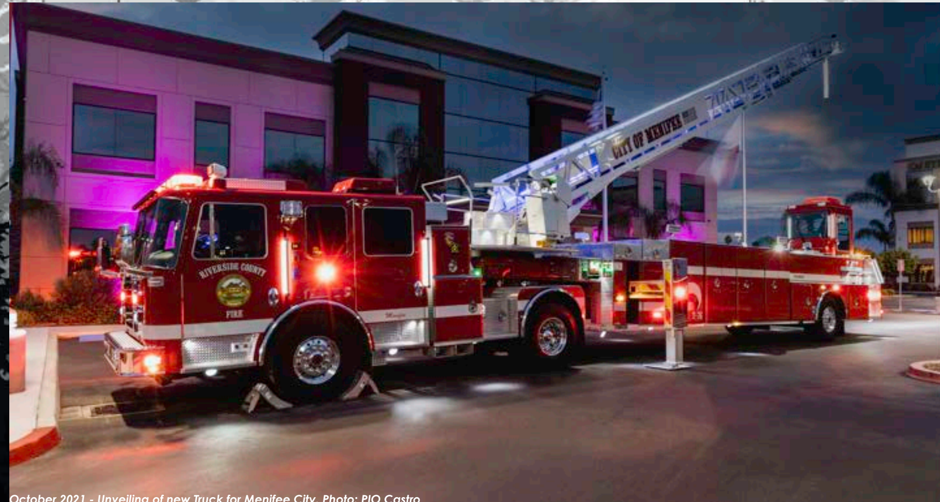
October 2021 - Unveiling of new Truck for Menifee City.