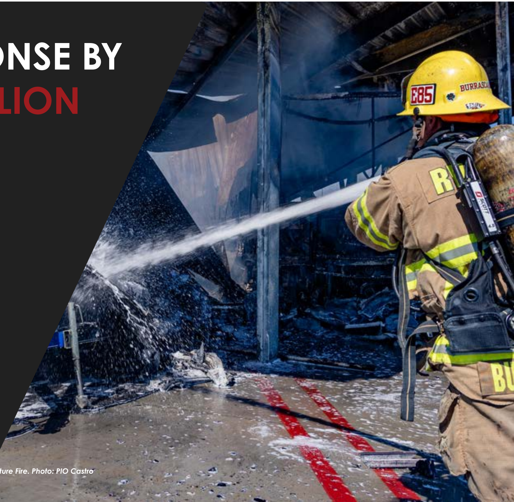
May 2021 - Commercial Structure Fire.